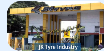
JK Tyre Industry