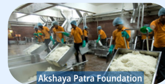
Akshaya Patra Foundation