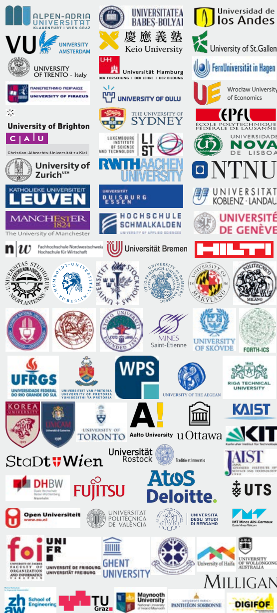
A selection from previous editions.