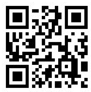
Executive and Continuing Education